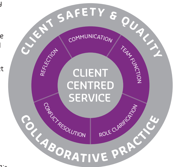
Figure 1. Curtin Interprofessional Capability Framework (Brewer & Jones, 2010)