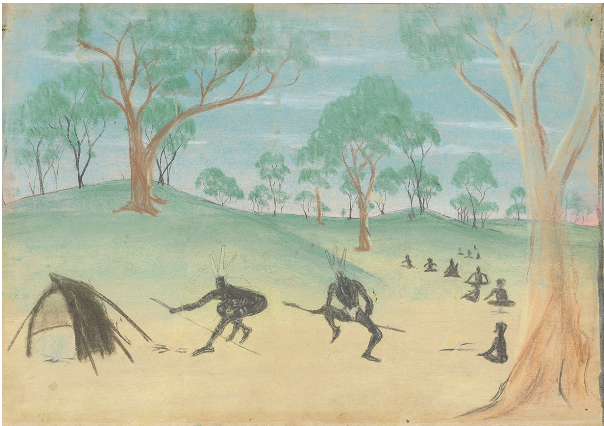
Image : Once Known Child Artist, Encampment II, c.1946, pastel, graphite, and charcoal on paper, 25.4 x 40.6cm.

An Education Program for students to learn about the culture, strength and resilience of the Stolen Generations through the artwork created by Aboriginal children at the Carrolup Native Settlement in the 1940's.