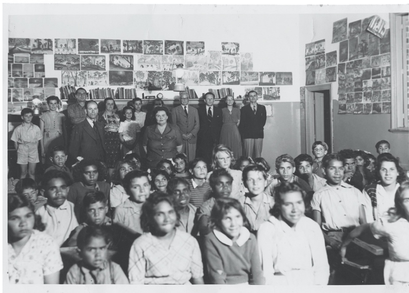
Above Image : Carrolup Classroom, photographed by Noelene White January 1948.

1964 – the Aborigines Act 1905 repealed by the Native Welfare Act 1963.